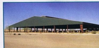
Horseshoe Park & Equestrian Centre