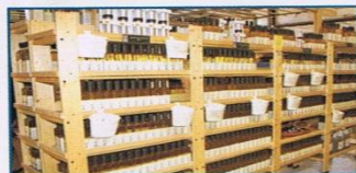
Queen Creek Olive Mill