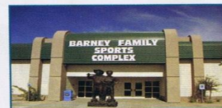
Barney Family Sports Complex