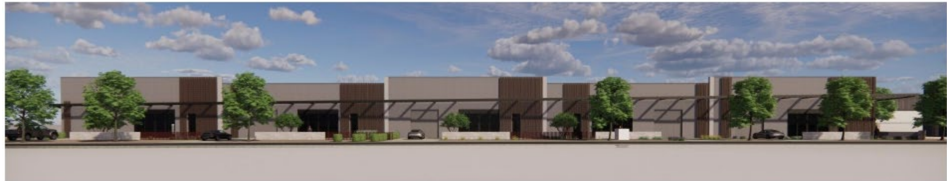
SOUTH ELEVATION PHASE 1 - BLDG B