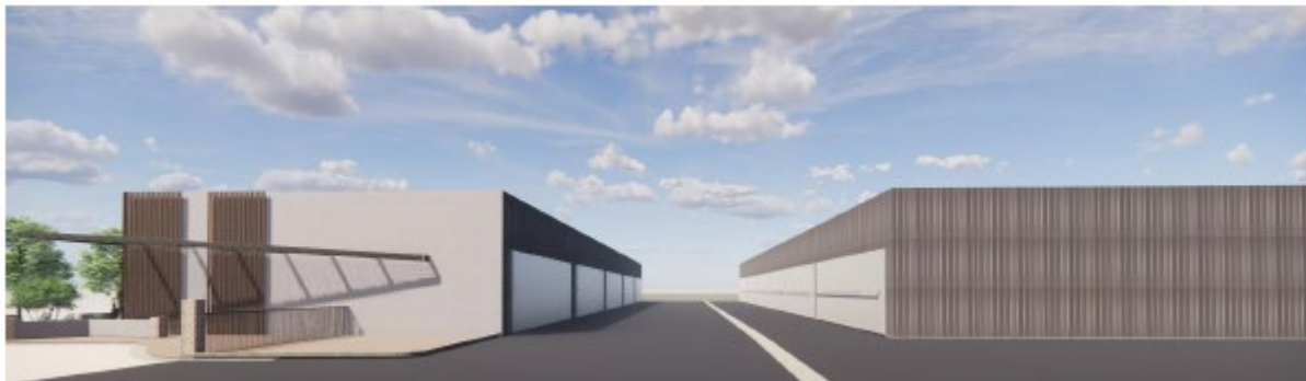
EAST ELEVATION PHASE 1 - BLDG A&B