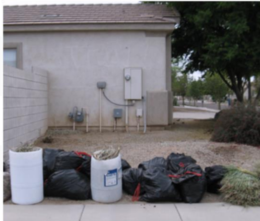
Monthly Bulk Collection