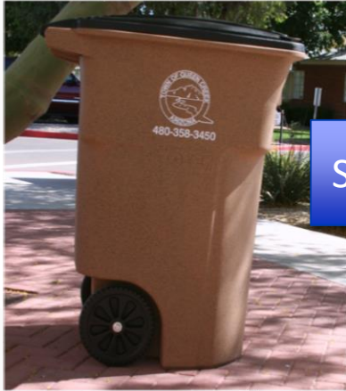
Weekly Refuse Collection