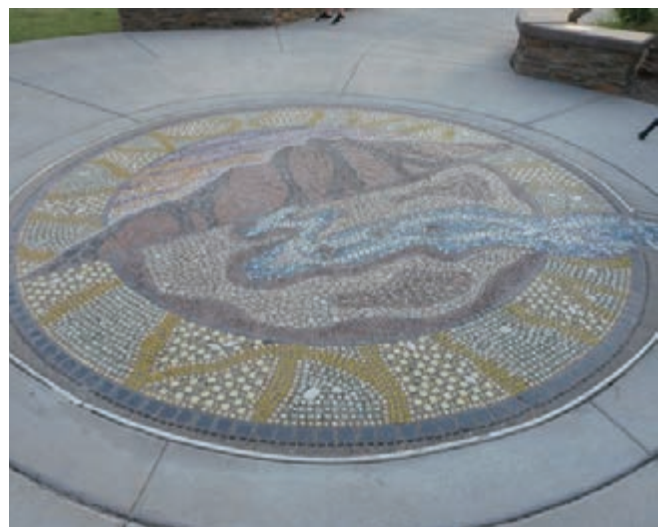
Public Art at Picket Post Square

Action 10.5: As amenities within Town parks are upgraded, ensure accessible features are integrated.