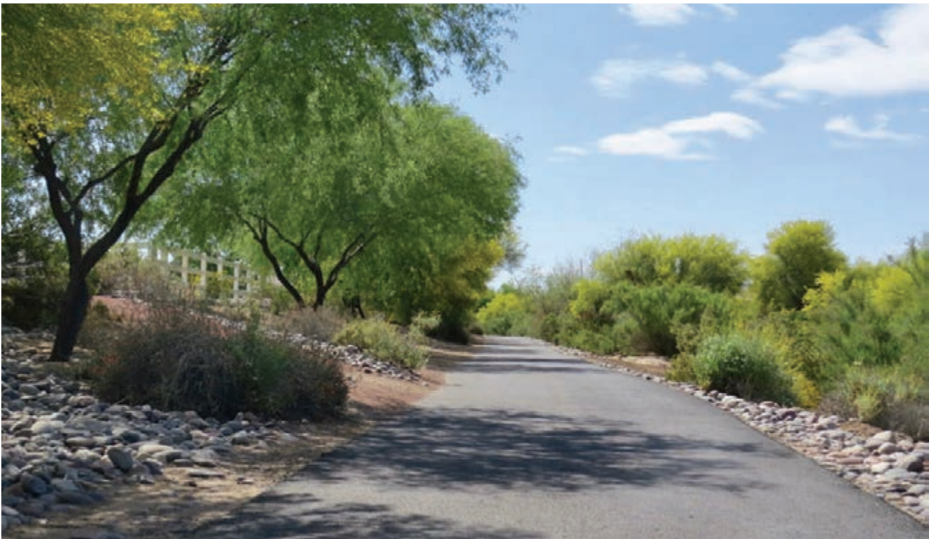
QC Wash Trail