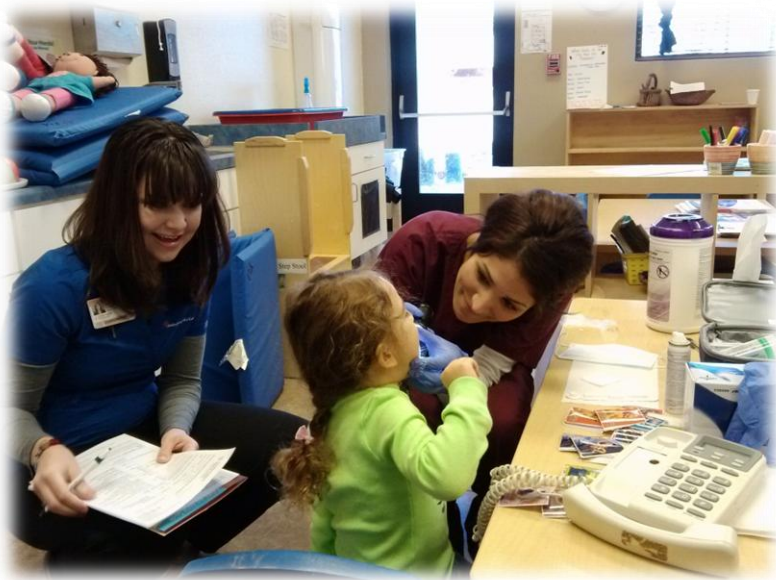
Oral Health Clinic at Bridges Preschool in Queen Creek-Feb 2013