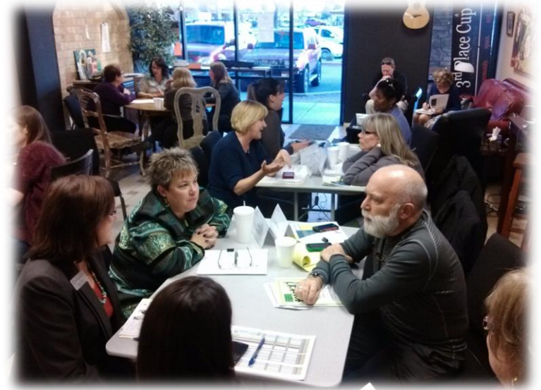
Region Council Meeting at Amadeo Vineyard Church in Queen Creek-Jan 2013